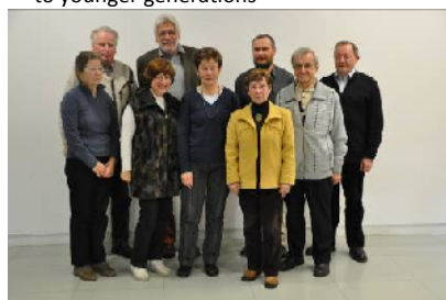
The team from Dresden